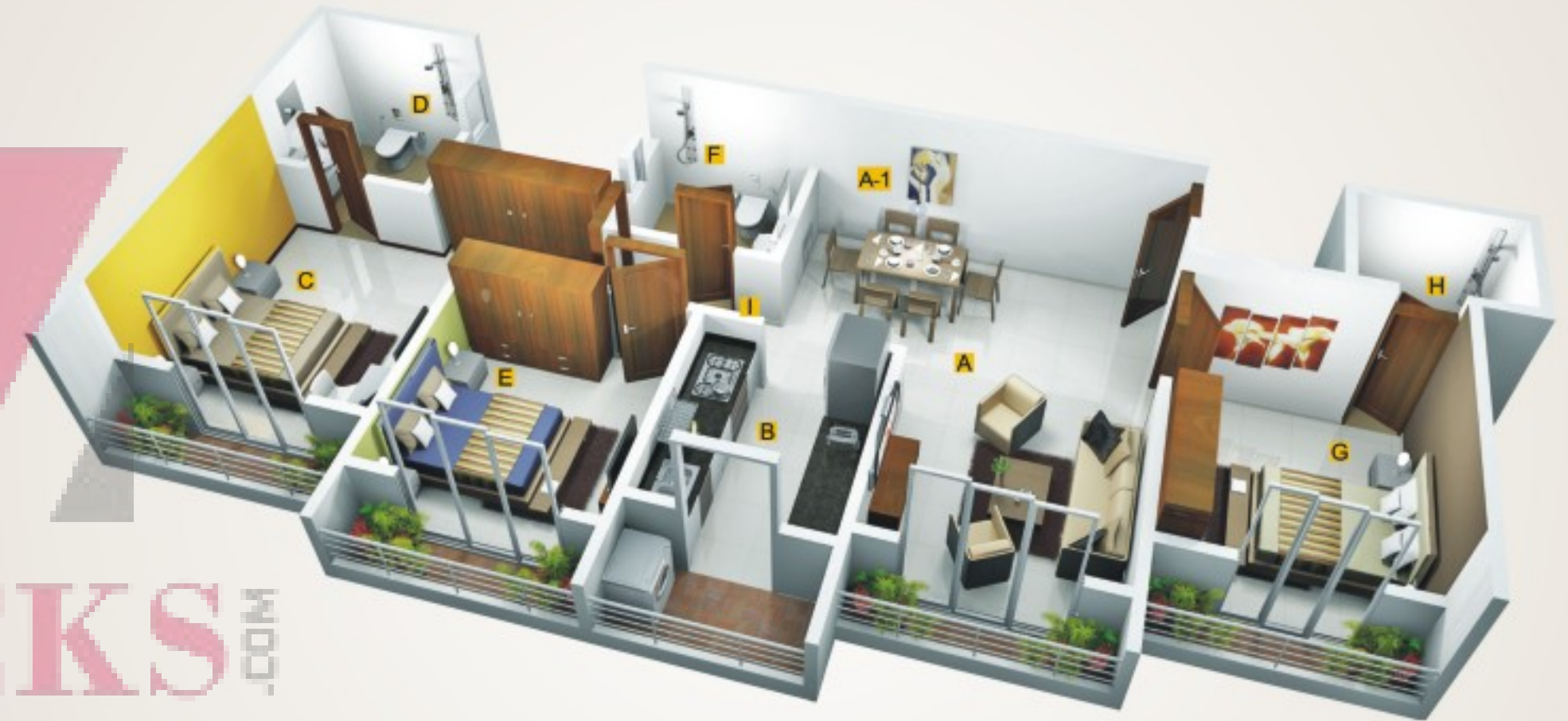
Typical Floor Plan 3 BHK